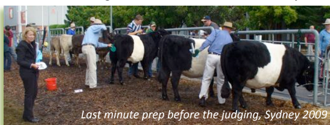
Last minute prep before the judging, Sydney 2009

The breed average for this show for solid Galloways was