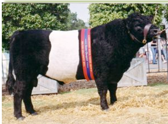
Peppercorn Wisdom - Senior Champion Bull Sydney Royal 2004 (also Grand Champion Bull Sydney & Brisbane Royals 2003).

Disclaimer: Opinions in this publication may or may not be the opinions of the Australian Belted Galloway Association Inc. or of its members. Information published is of a general nature only and offered in good faith. Readers are advised to rely on their own enquiries and seek further advice from appropriate sources.